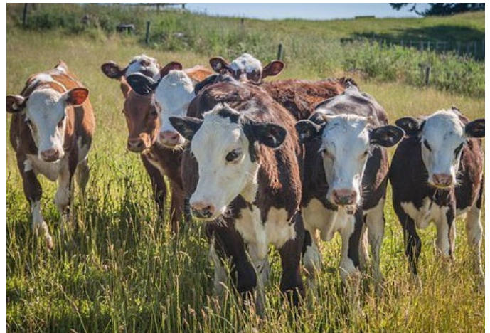
Herd of Cattle