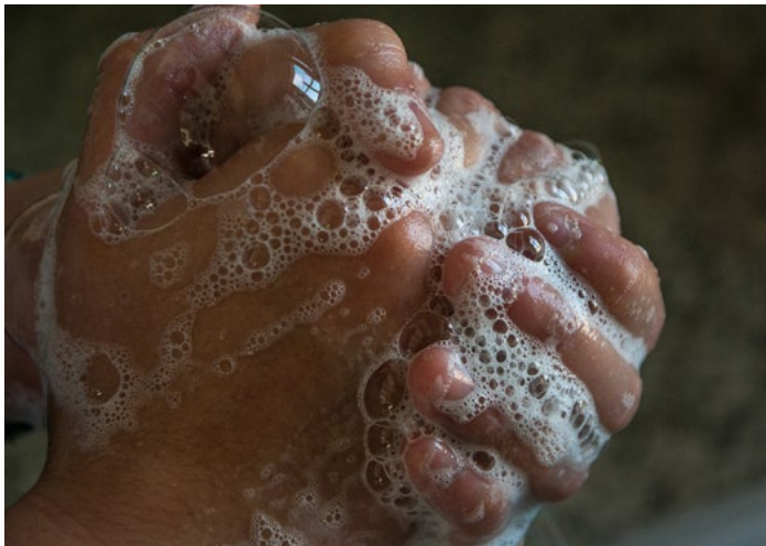
Washing hands for 20 seconds, with soap, is key to containing communicable diseases.