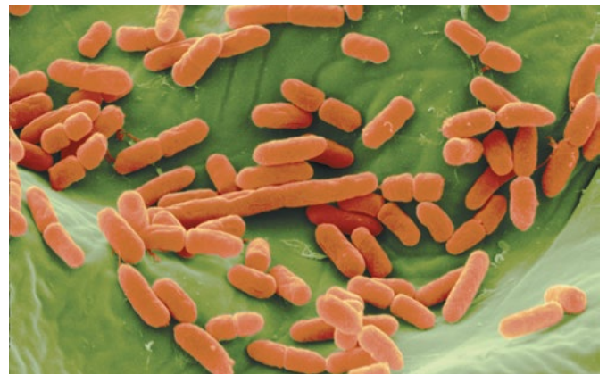
E. coli bacteria on a lettuce leaf.

When an E. coli outbreak is traced to a food item as the source, the food is recalled. That means stores and restaurants who sell the item stop using it. People who have the food at home don't eat it. Outbreaks caused by E. coli bacteria can be contained once the source is found, the contamination problem is fixed, and people stop eating the food. But there is one more important step. Just as E. coli was first caused by animal feces from a farm, the feces of an infected person carry the bacteria, too. When an infected person uses the toilet and doesn't wash their hands carefully with soap and water, everything they touch when they get up from the toilet has the bacteria on it. One way to get infected by E. coli is to eat contaminated food. Another way to get it is to touch something another person has touched who used the toilet and didn't wash their hands. When you touch something they touched, and then touch your own mouth, you transfer E. coli into your own body.